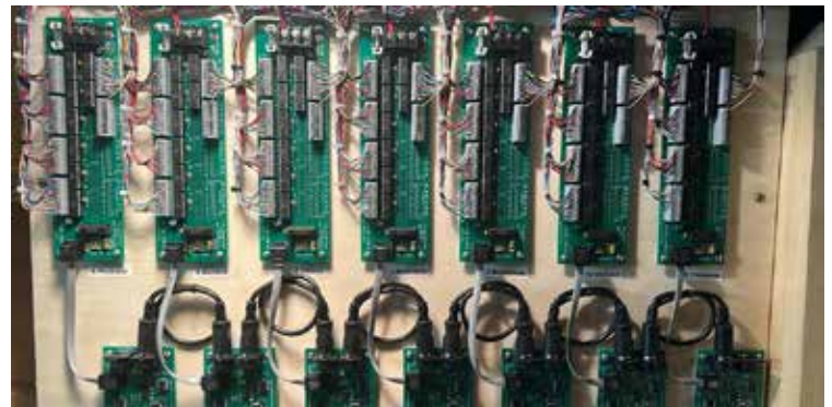
Organ Panel Rewired and Ready to Go