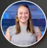
DIANA Youth Ministry