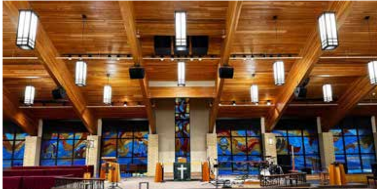
New Speakers Offer Better Sound at Any Seat

As a part of the On Mission Capital Campaign, the sound system upgrade has been completed! This project involved removing old equipment and wiring and adding new wiring, speakers, sound board, and other equipment. The speaker system provides better coverage to all areas of the sanctuary, especially the choir area and the front right seating area. The sound board and other equipment were upgraded to have more capacity and be more universally compatible with other equipment in the future. Additionally, repairs were made to the sound infrastructure allowing for more choir mics, a more reliable hearing assist system, and expanding the band inputs on the chancel.