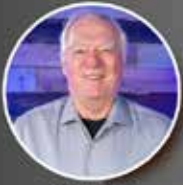
DENNIS Finance (part-time)