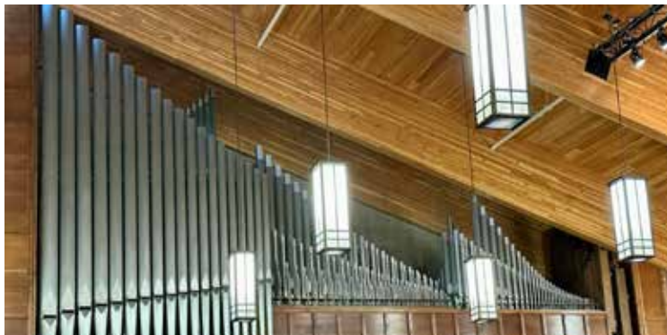
Casavant Organ Pipes in the Sanctuary