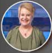
LINDA Congregation Engagement