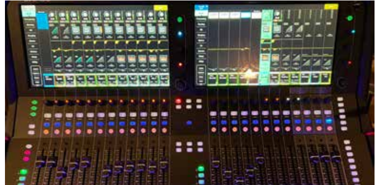
Upgraded Sound Board Allows for More Sound Options